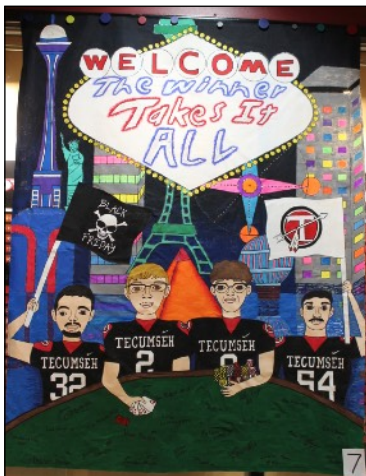
2nd Place THS Drawing Class

The theme of this year's banner contest was "The Winner Takes It All" and once again the Class of 2025 took 1st place, followed by the THS Drawing Class with 2nd and the middle school FFA coming in 3rd.