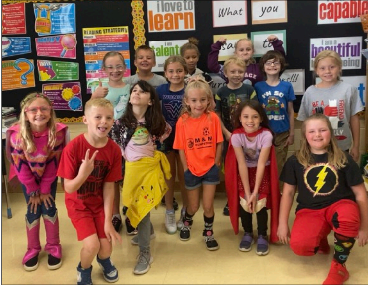
One of the themes of the week was Super Hero Day!