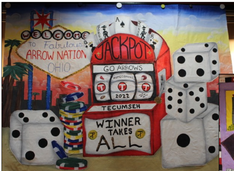
1st Place The Class of 2025