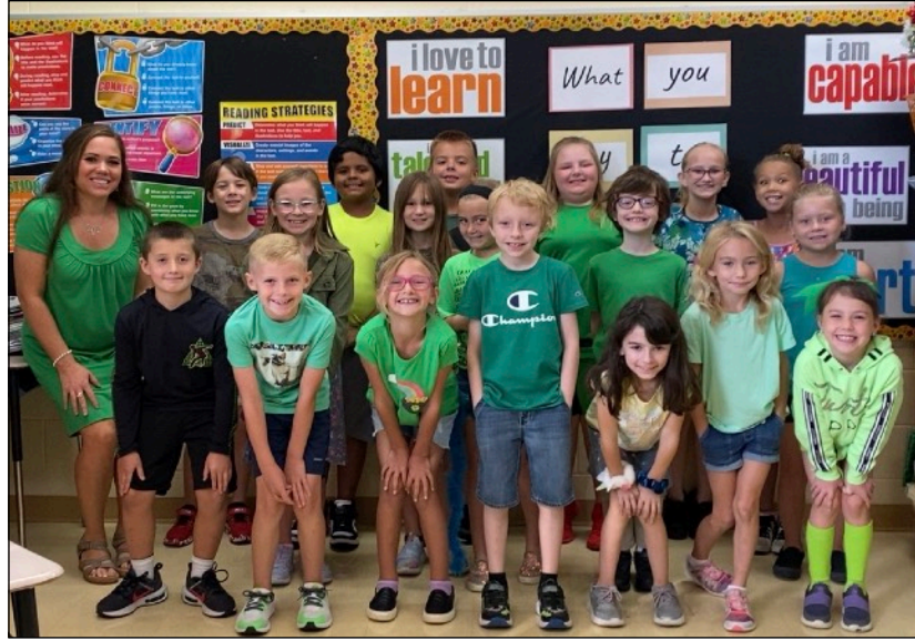
Green was worn as a symbol of unity to support the Sandy Hook Promise.